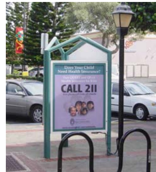
Town Center of Mililani