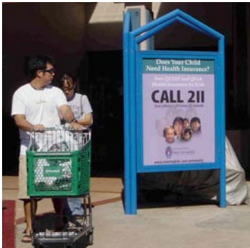
Gentry Waipio Center